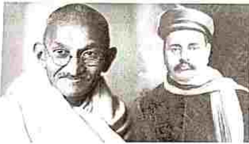
Gopal Krishna Gokhale (1866-1915) Maharashtra