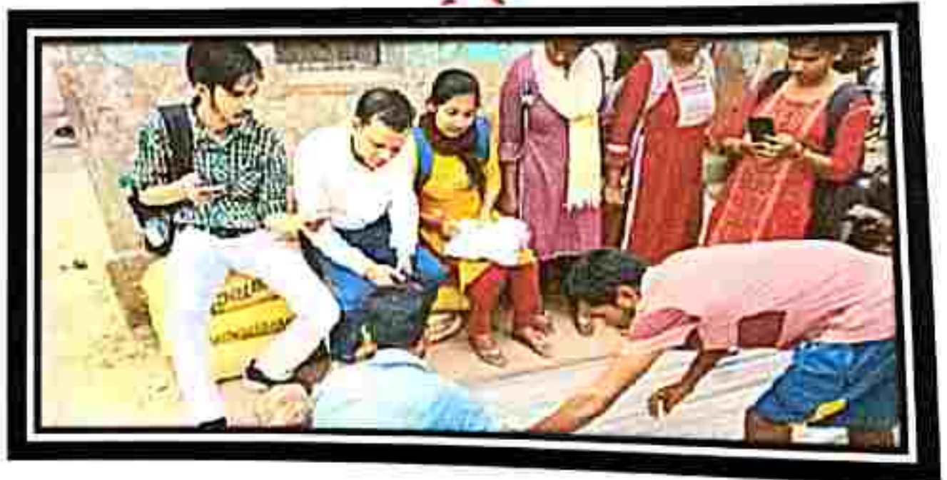
Teacher and Students Group (9 th February 2020)

Kenjakura is famous for cotton handloom (Towel and Sari)