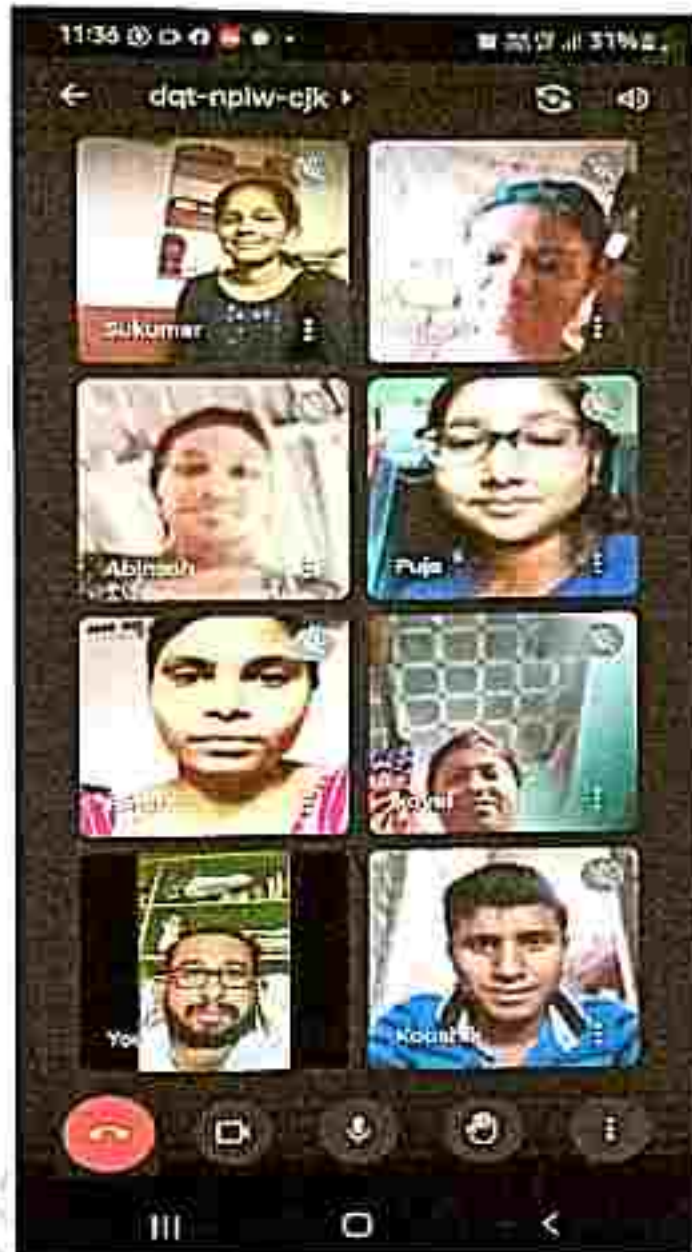
OUR STUDENTS GROUP